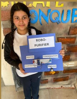
Grade 5 Water wonders innovating purification & Reuse