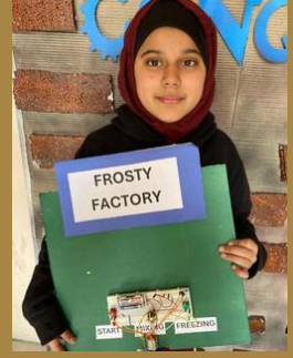
Grade 4 The Frosty wizard Ice cream innovations