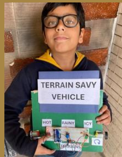
Grade 3 Wheel moving clockwise & anti-clockwise