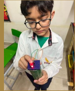
Grade 2 Emergency torch flashlight circuit