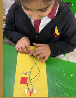
Grade 1 Light up sorter for recyclable material