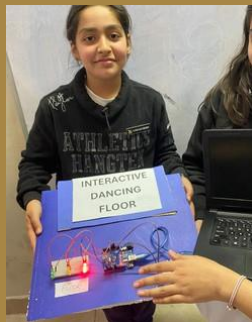
Grade 6 Interactive kinetic dance floor