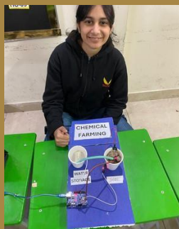
Grade 8 Chemical farming reaction powered agriculture